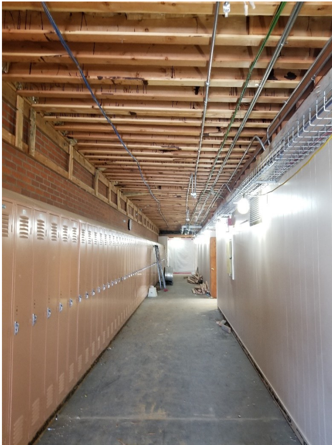
Old 3 rd Grade Hallway