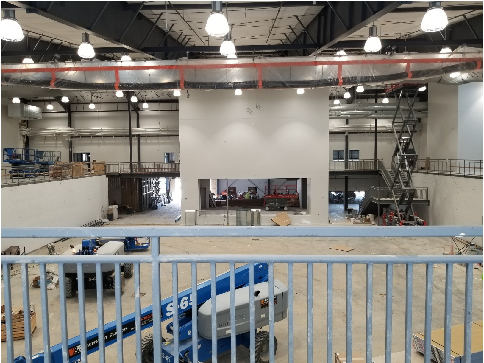
View of Stage from Opposite End of Gym