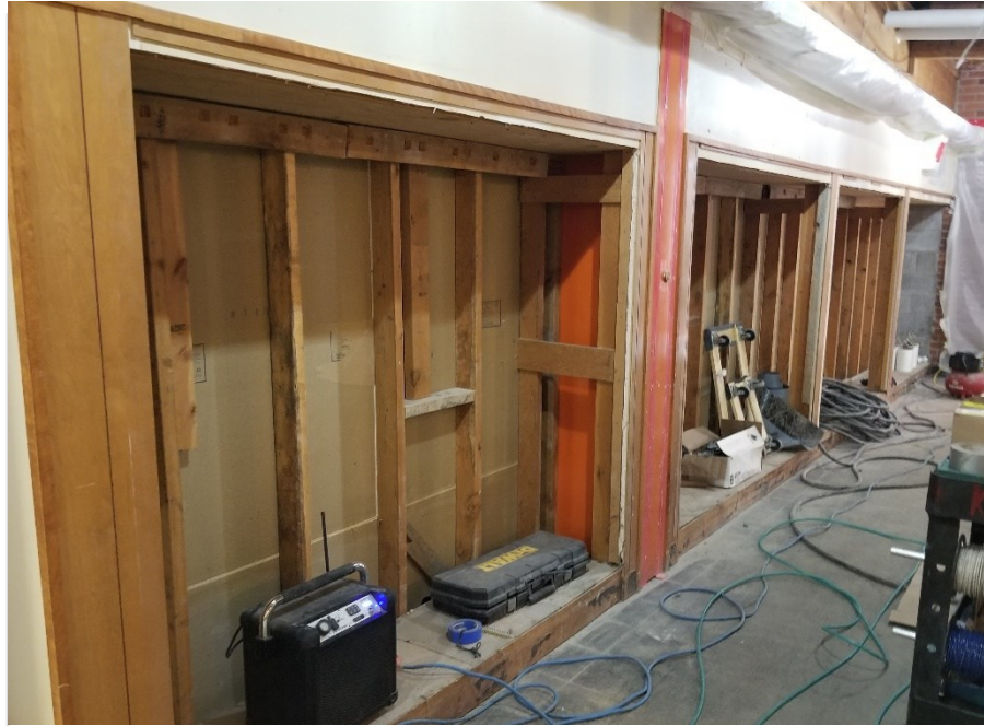
2 nd Grade Lockers removed