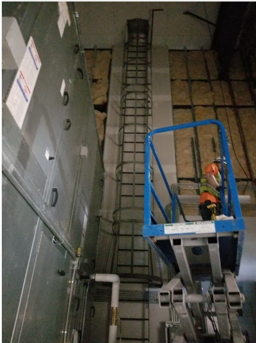
Roof Hatch to Radio Antennae