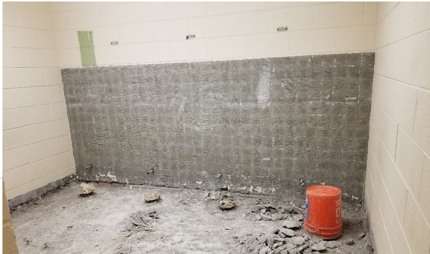
3 rd Grade restroom demo