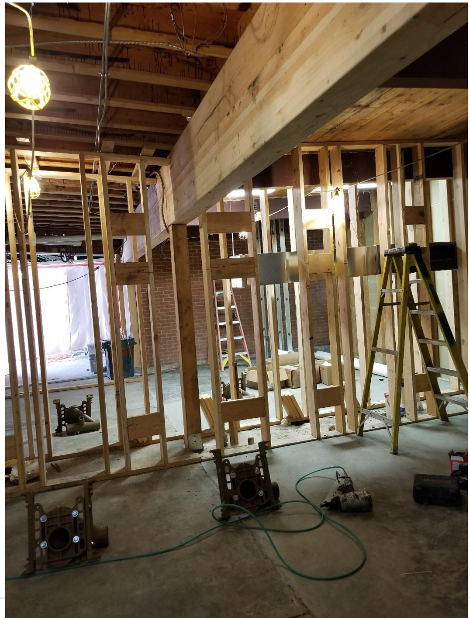
Restroom rebuild at Elem