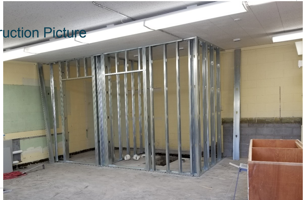
New restrooms for SPED in Mrs. Weeda's old room