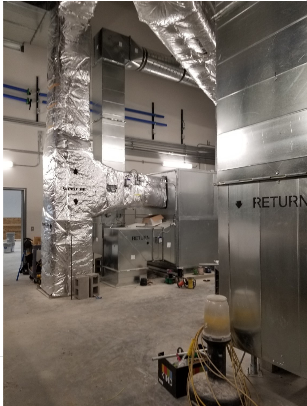
Air Handlers for Gym