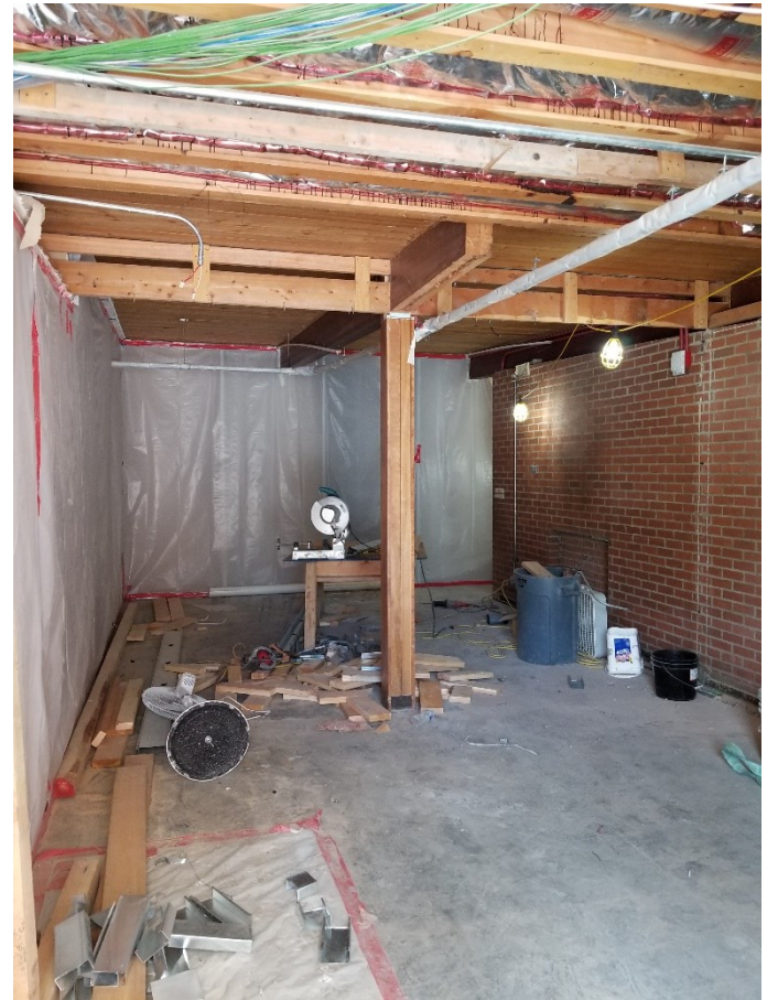
Entrance by Elem Library